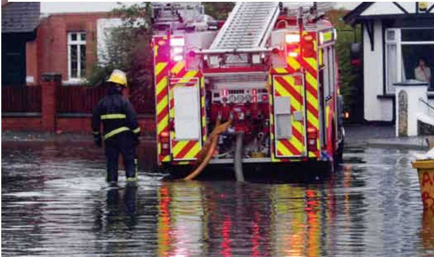
▲ Fire services helping in a flood-affected residential area in Belfast

As severe flooding incidents occur increasingly across the UK, a growing body of literature is emerging from both academic and policy perspectives. This section introduces some of the key documents in this area, including external studies and papers from British Red Cross experience. The literature presented will focus on the themes of response, recovery, health impacts, policy developments and vulnerability.